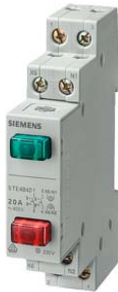
PUSHBUTTON, D=70MM 1NC/1NO 20A, 2BUTTON RED+GREEN LAMP 230V