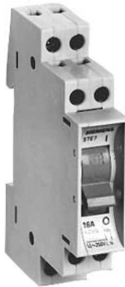
SWITCH, N-TYPE, OFF W. PILOT LIGHT, 1POLE 16A 230V