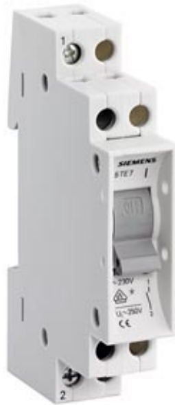
SWITCH, N-TYPE, OFF 1POLE 16A 230V, SEALABLE