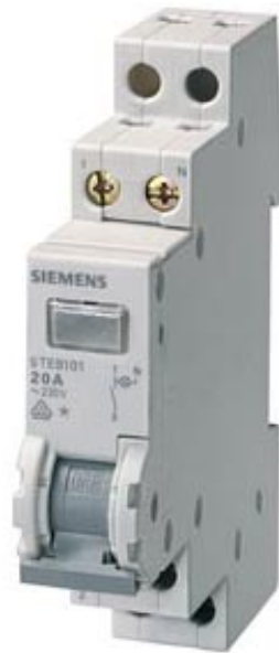
CONTROL SWITCH, D=70MM 20A 1NO, 1 LAMP 230V