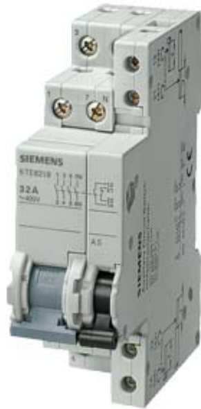
SWITCH, D=70MM 20A 3NC+N W. AUXILIARY CURRENT SWITCH 1NC/1NO