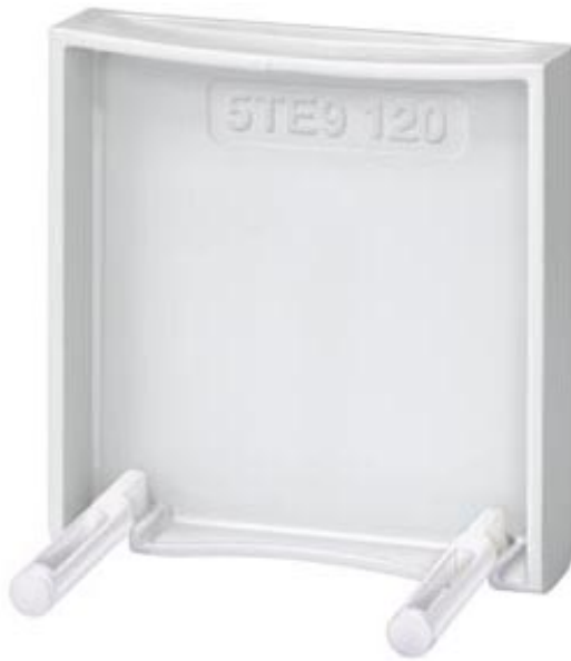
COVER FOR SOCKETS 5TE68 PLUGGABLE ON 5TE6800, 5TE6803, AND 5TE6804