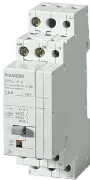
REMOTE SWITCH 1 NO CONTACT CENTRAL AND COMBINED CIRCUIT CONTACT FOR AC 230,400V 16A ACTIVATION AC 24V