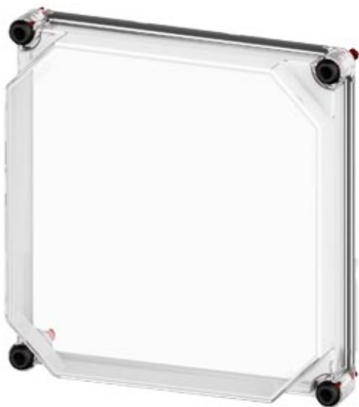
COVER, TRANSPARENT SIZE 2, MOUNTING DEPTH 212MM