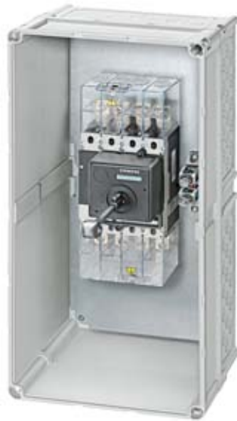
8HP WITH 3VL CIRCUIT-BREAKER 63A, TM-RELEASE, 3-POLE