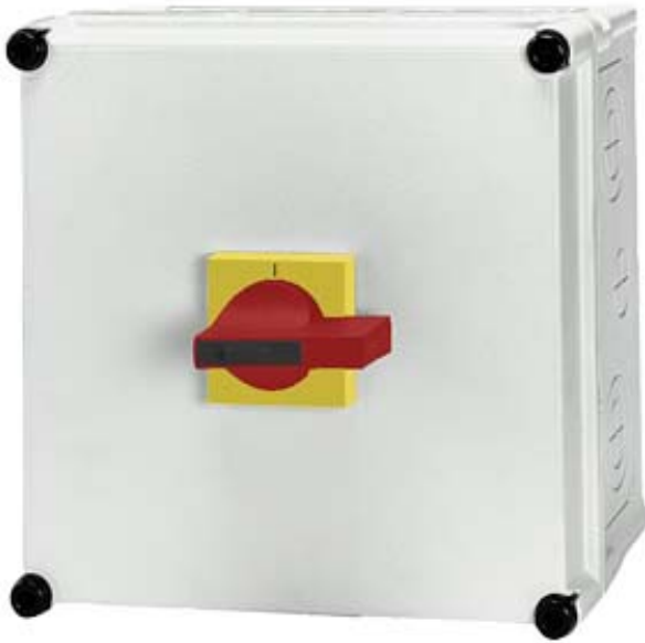
SWITCH DISCONNECTOR, 3-POLE EMERGENCY-OFF OPERATING MECHANISM 3KE44, 630A, SIZE 3