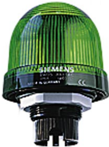
BUILT-IN LUMINAIRE FLASHLIGHT, 24V, GREEN